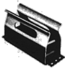
Fig 180A: Steel Concrete Insert