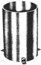
FIG 7 PIPE SLEEVE WITH WELDED LUGS

Phone: (718) 507-8844 Fax: (718) 565-6018 Email: info@irauch.com Address: 32-20 112th St, East Elmhurst, NY 11369