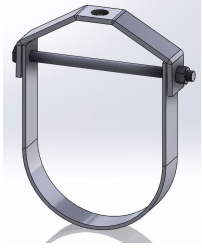
Fig 100: Clevis Hanger

Material: Steel Service Application: General piping. Finish: Black, galvanized or painted. Ordering: Specify size, figure number and finish.