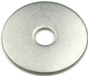
FIG 103 F