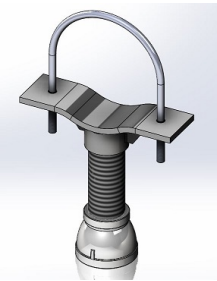
Fig 124: Adjustable Pipe Saddle Support with U-Bolt

Material: Steel Service Application: For general piping running close to the floor. Finish: Black, galvanized or painted. Ordering: Specify size, figure number and finish. Complete unit consists of saddle, nipple and cast iron reducer assembled. Saddle may be ordered separately. Screwed floor flange and pipe, as shown, or welded base plate and pipe must be ordered separately.