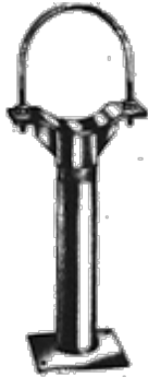
Fig 125: Pipe Saddle Support with U-Bolt