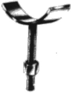
Fig 137: Adjustable Pipe Saddle Support

Material: Steel Service Application: Adjustable Pipe Supports are used in conjunction with a pipe standard and flange at the base, to support piping where an overhead supporting member is not available. The stem is threaded its full length, with a nut to allow a vertical adjustment to take care of the pitch in the pipe line. Finish: Black, galvanized or painted. Ordering: Specify size, figure number and finish.