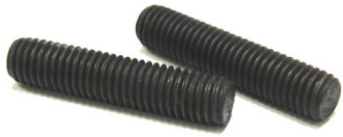
FIGURE 161 FULL THREAD STUD

Phone: (718) 507-8844 Fax: (718) 565-6018 Email: info@irauch.com Address: 32-20 112th St, East Elmhurst, NY 11369