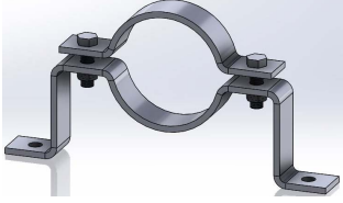
Fig 179: Offset Pipe Clamp

Material: Steel Service Application: To support general piping, running from wall or floor. This clamp can be furnished with "E" dimension to suit field conditions. Finish: Black, galvanized or painted. Ordering: Specify size, figure number and finish.