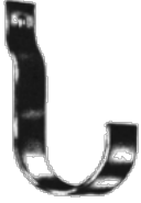
Fig 227: Offset J-Hook

Material: Steel Service Application: For general piping running next to wall. Finish: Black, galvanized or painted. Ordering: Specify size, figure number and finish.