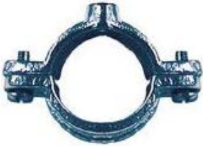
Fig 81: Split Ring Hanger

Material: Malleable iron. Service Application: General piping. Finish: Black or galvanized Ordering: Specify size, whether tapped for pipe or rod, figure number and finish.